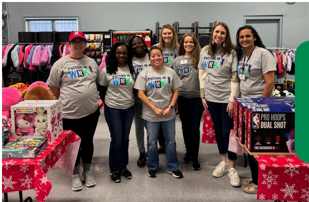
Kingswood Community Center Coat & Toy Giveaway