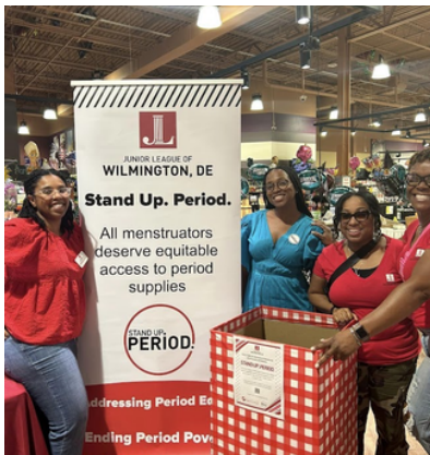
Members attended the Ladybug Music Festival and shared the Stand Up. Period. Initiative.